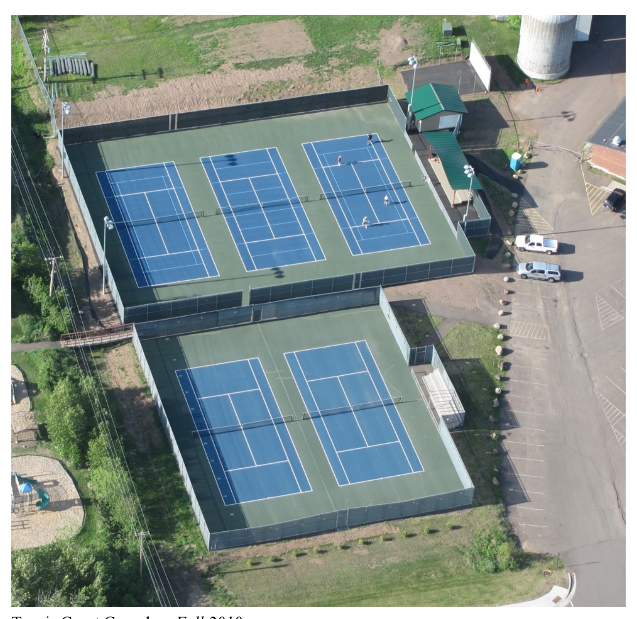
Tennis Court Complex. Fall 2010

locals and tourist play tennis. For example, the CCTA is currently working on plans to enlarge the storage building, build a roof over the viewing stands on the south court and improve the practice hitting wall and deal with some surface cracks on the north courts.