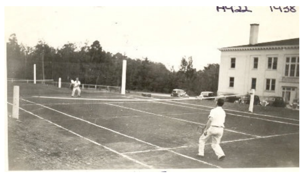
Photo of two Grand Marais Tennis Courts in 1938. There was a fine wire mesh net between the two tall posts at the base of each court that is not visible in the photo, but can be seen in a digitally enhanced photo. The posts for the fencing on the north side and west end are not visible in the photo. It should also be noted that (1) there was no fence on the sides of the courts and (2) the fence separating the two courts appears to be quite close to the baselines of the courts.

The surface of the rebuilt court was asphalt. Unfortunately, the fence was located to close to the baseline for contemporary tennis. This factor undoubtedly minimized the use of the courts by better players during the sixties and seventies.